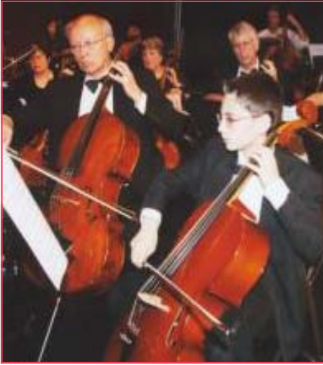
New Jersey Intergenerational Orchestra, Cranford, NJ