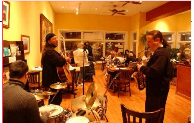
Third Friday Gallery, shopping and dining throughout the Glasstown Arts District in Millville is an event everyone enjoys.

Apply advanced technology: Every goal of this plan is advanced by the effective application of the most modern technology from the creation of art itself, to its marketing, operations, advocacy, accessibility and state of the arts facilities. We need to assess conditions now, build capacity as a priority, and provide both capital and technical assistance on all fronts.